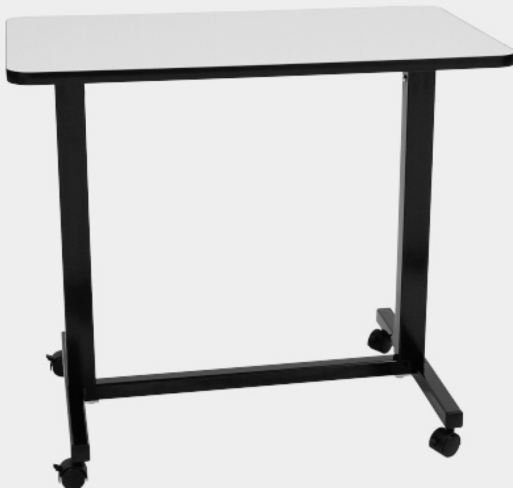
Adjustable Hand Therapy Table / Model 1020 Acute Care Tables